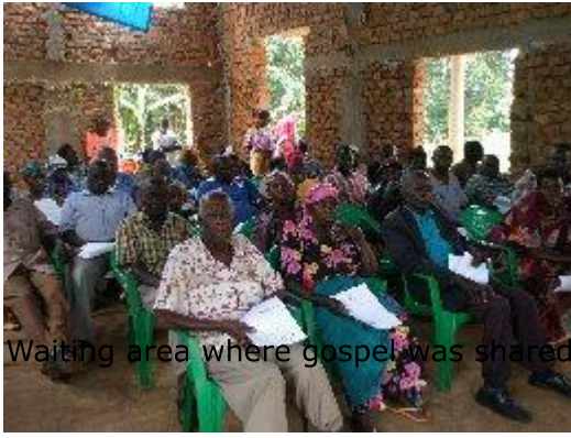
Waiting area where gospel was shared