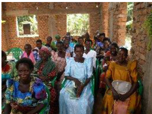
Ladies Sunday School Class

One Monday, we begin the church leadership seminar here at the guest house.