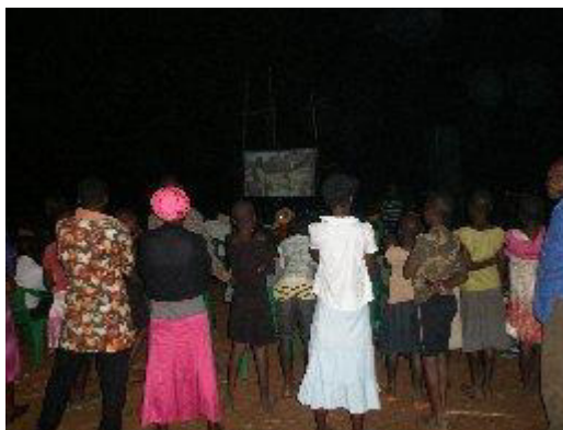
Open Air Crusade