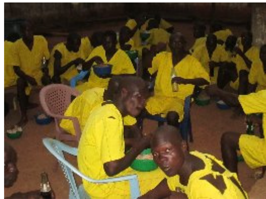
Another Prison Ministry photo