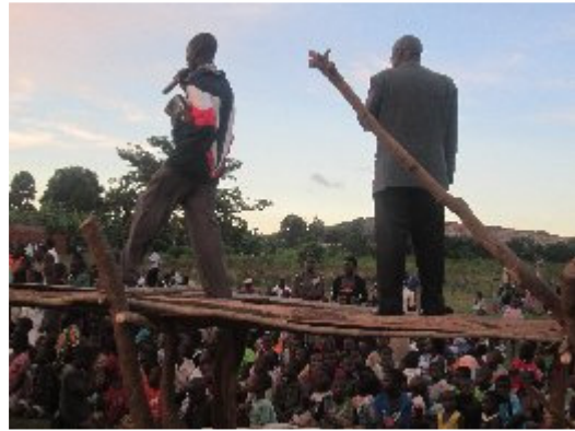
Open Air Crusade